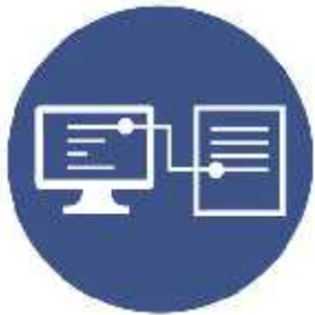
Note Form Reporting